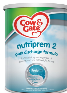
Powdered 800g tin

Health information and support is available at www.nhs.uk or call 111 for non-emergency medical advice