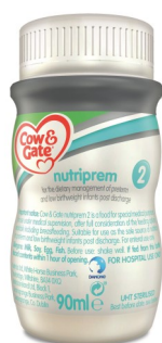
Ready-to-feed 90ml bottle (Available in hospitals only)

You have been given this leaflet as your baby is due to go home on Nutriprem 2 formula. A slow change from ready-to-feed liquid formula to powdered formula is known to help prevent tummy upsets. This leaflet will help you understand this change.