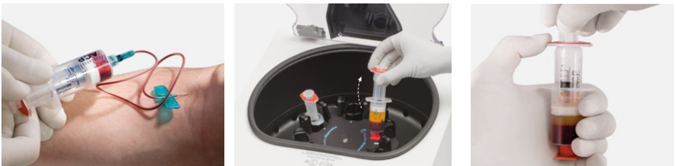
Blood taken and layers separated